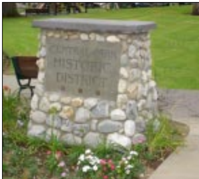
Central Park Monument Sign

Central Park visitors entering and leaving near the park's southeast corner were pleasantly surprised this past June with the appearance of a third neighborhood monument sign. Like the other two located in median islands on Hadley Street and Painter Avenue, this most recent sign was paid for with funds raised by WHNA's Annual Neighborhood Home Tour. Cost for construction and installation of