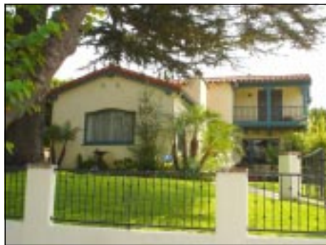
Spanish Revival 2007 Tour Home

You can catch a glimpse of this era gone by at the 2007 WHNA Home Tour on Saturday, October 27, from 10AM to 4PM. Don't miss this