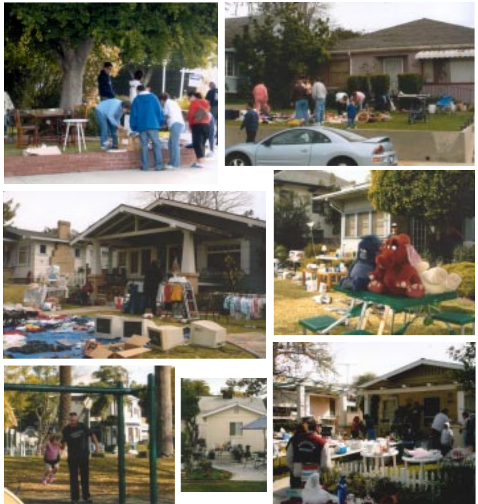
Whittier Historic Neighborhood Association Yard Sale, Saturday, March 25, 2006